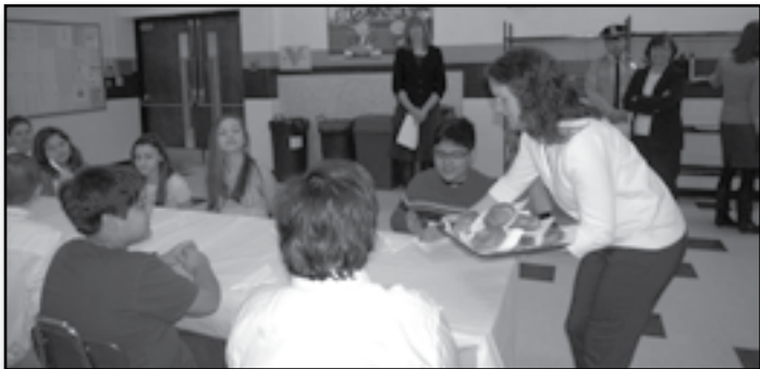
Students are served up delicious croissants at “Chez Pearl”.

The message, as students prepare to take the New Jersey Assessment of Student Knowledge (NJ ASK) in the first week of May, is that there is a big difference between formal writing for school and casual writing, such as texting.