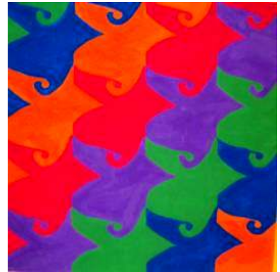
Becky H Tessellation "Tessellation"