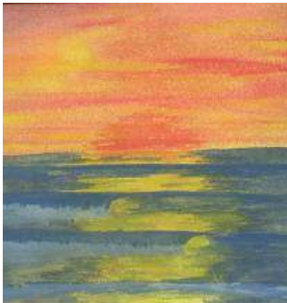
Tighe K Watercolor "Parallels of Life"