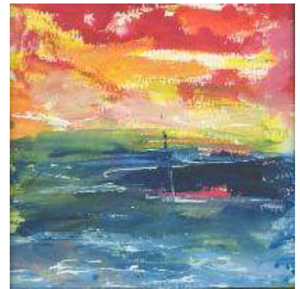
Brooke T Watercolor "One In a Nut Shell"

But now its time to go our own ways Just like the ocean dancing away