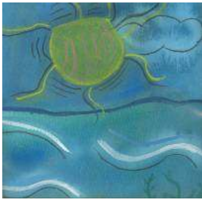
Jackie B Watercolor "Day Break"