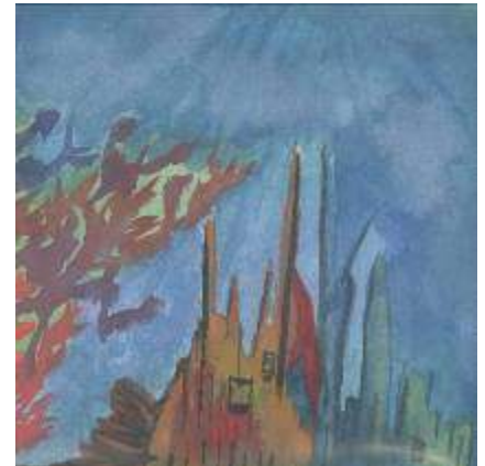
Ari I Watercolor "Deep"