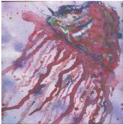
Jess K Watercolor "Mystery"