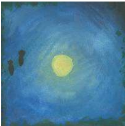
Lindsay C Watercolor "Meeting a Stranger"